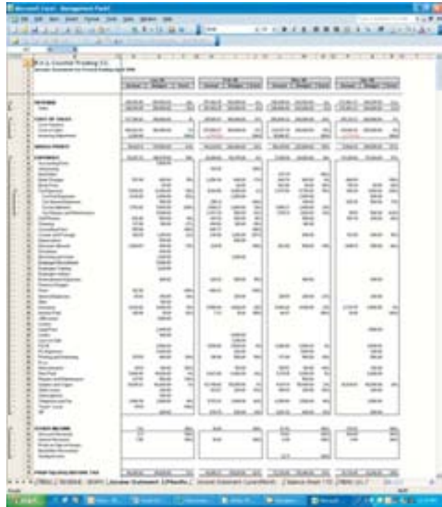
Example of income statements